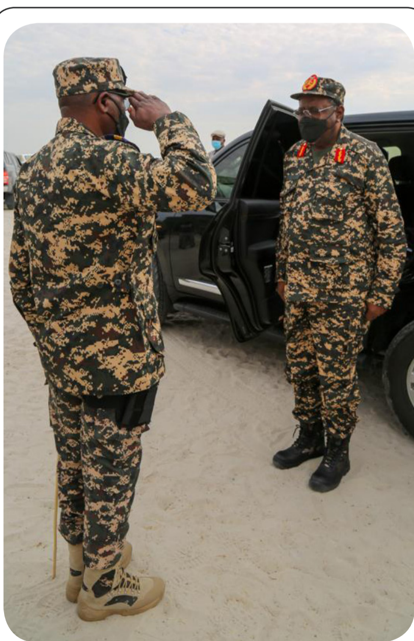
El Comandante... The Defence forces commander-in-chief, President Hage Geingob, decked in complete military attire, ready to officiate at the Khan Strike II exercise in the Oshana region on Thursday (see story on page 3).